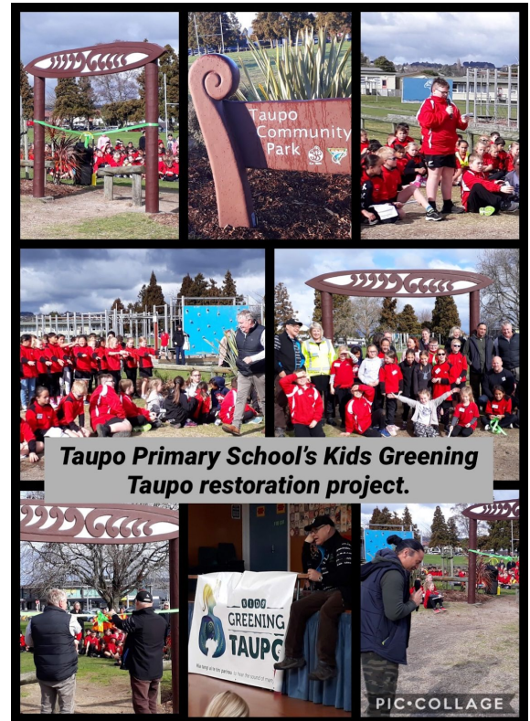
Taupo Primary School's Kids Greening Taupo restoration project.

Attendance- this continues to be of a huge concern at our school and our data does not look good. The ministry has a 10% tolerance for absence and anything less is of concern or considered poor attendance. Below is a table of our school. The grey shaded row is the absent percentages of children who are working below their expected curriculum level for example, 65% of the year 6 students who were working below have poor attendance. It is extremely hard to support your child and get them where they need to be if they are absent.