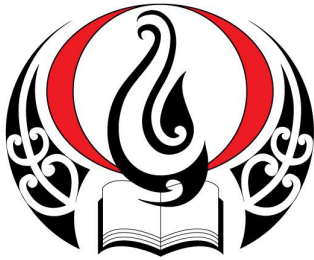
Taupo Primary School