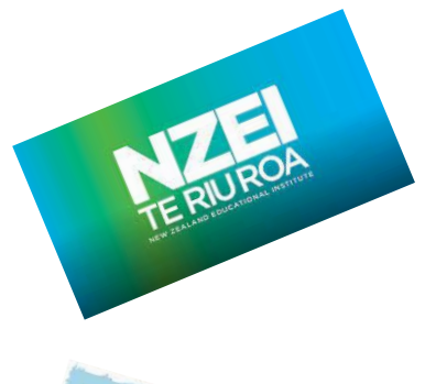
Taupo Primary School